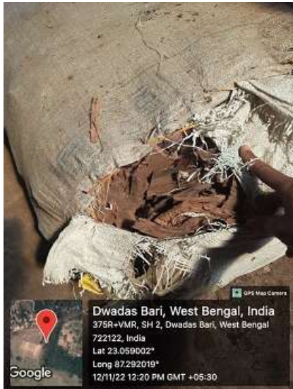
sun dried bark